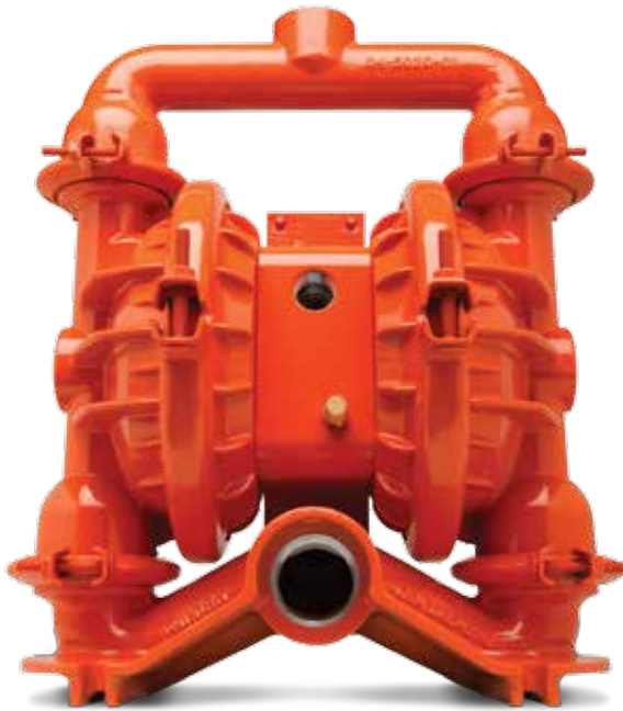
Wilden® PS4 Series Pump