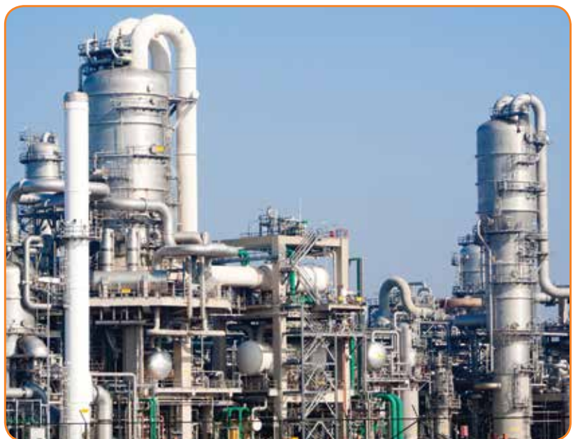
AODD Pumps have long been reliable performers in a wide range of industrial pumping applications. The new Pro-Flo® SHIFT from Wilden® takes that reliability to an all-new, cost-optimizing level.

Most recently, a new generation of ADS has attempted to eliminate overflowing in AODD pump operation. This next-generation ADS technology claims to prevent overflowing by cutting off the air supply to the air chamber before the end of the pump stroke. There are two shortcomings, however, in this approach. First, this ADS technology is electronically monitored and controlled, rather than mechanically actuated, which raises an entirely different set of energy usage, maintenance and operational concerns. Second, this electronic ADS technology requires time to "learn," meaning that every time the pump is turned on, the electronic system needs a "learning period" of 30-40 seconds, where it monitors the operation of the pump before it can estimate when to cut off the air supply prior to the end of the stroke. This can result in erratic and inconsistent flow rates for up to 40 seconds and a corresponding waste of air, a drawback that is compounded in dosing operations that feature constant on-off cycles.