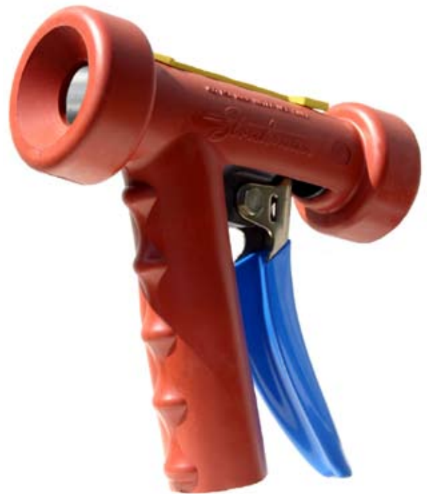
Shown: Black S-Series Nozzle Available shown below: S-77 (red cover), S-75 (white cover)

Strahman's spray nozzles are available in black, white or red and are available made of stainless steel or bronze. Special assembly for food grade is also available.