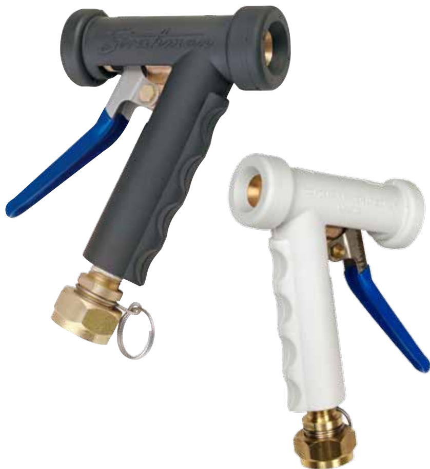
Mini M-70 Spray Nozzle