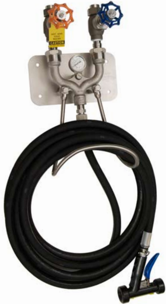
Shown: Stainless steel M-750TG with globe valves; shown with premium hose assembly and S-70 Series nozzle Available: Standard M-750 , bronze M-159 and M-159TG

Please see reverse side for parts listing.