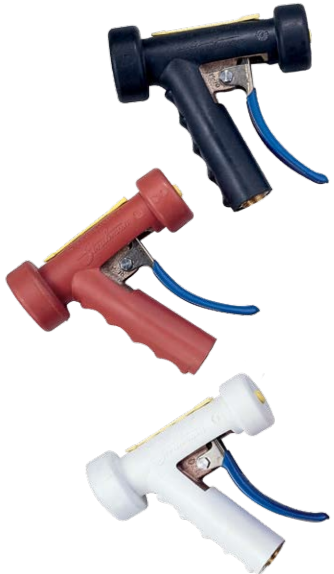
Shown: Red M-70 (black cover), M-75 (white cover), M-77 (red cover)

Please see reverse side for parts listing.