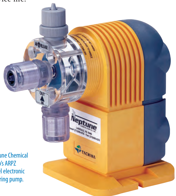
Neptune Chemical Pump's ARPZ model electronic metering pump.

to 300 gph, and can be provided with automatic frequency control. A micrometer dial can adjust capacity on the Series 7000 while the pump is running (10:1 turndown). They are available with flow rates from 6 to 300 gph at pressures to 150 psi. The Series 7000 pumps are available in PVC and Kynar® construction – which are most suitable for sodium hypochlorite applications – and all parts within the gearbox are submerged in oil for extended service life.