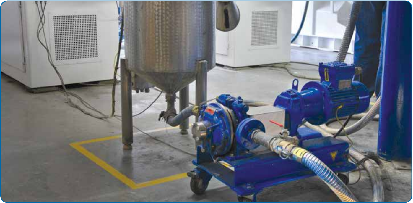
Eccentric disc technology, seen here in the A Series pump, addresses the inefficiencies found in internal gear and lobe pumps.

From a performance perspective, the redesigned A Series has doubled its maximum differential pressure from 5 bar (73 psi) to 10 bar (145 psi), allowing it to be used in many new applications. The A Series pumps are now available in ductile-iron construction. Previously, the A Series was available in cast-iron construction only. This material enhancement is critical as more and more companies in the petrochemical industry are moving away from cast-iron construction.