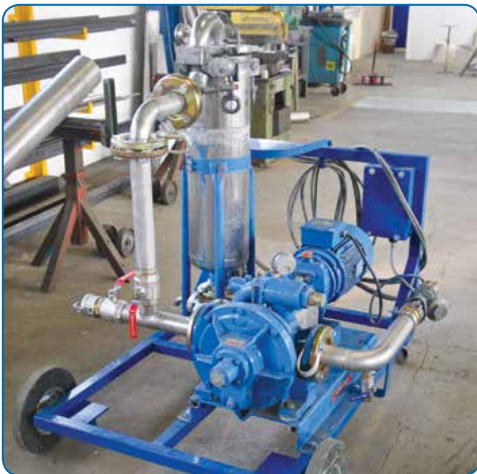
A Series Eccentric Disc Pumps are self-priming, ensuring strong suction even after the pump runs dry, which is critical in applications such as paint and coatings.

Eccentric disc pumps consist of a cylinder and pumping element mounted on an eccentric shaft. As the eccentric shaft is rotated, the pumping element forms chambers within the cylinder, which increase in size at the intake port, drawing fluid into the pumping chamber. The fluid is transported to the discharge port where the pumping chamber size is decreased. This action squeezes the fluid out into the discharge piping.