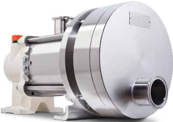
Mouvex® SLS Series Eccentric Disc Pump